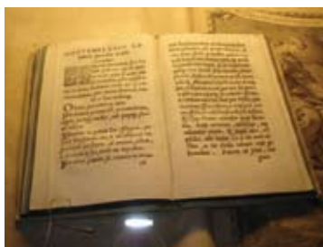
Early edition of the Spiritual Exercises

Yet, more startling in many ways have been the signs of new life in unexpected quarters. The rapid rise of lay persons interested in Ignatian